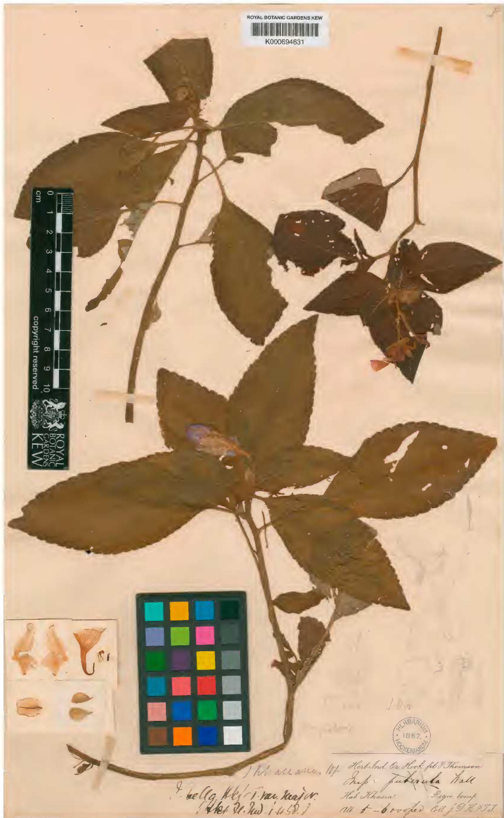
Fig. 1. Lectotype of Impatiens khasiana Hook. f., J.D. Hooker & T. Thomson s.n., (K694831!)